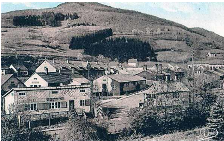
The security camp at Schirmeck-La Broque.

Her father had also been interned, but in Poland, in retaliation for his son's refusal to serve in the Wehrmacht.