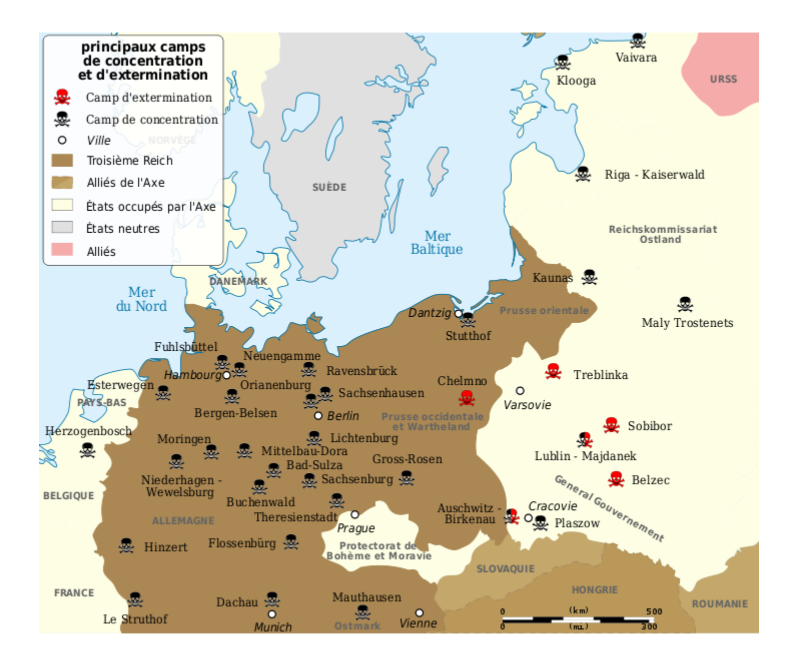
Document from the Wikipedia Internet Webside about the nazi concentration and extermination camps.